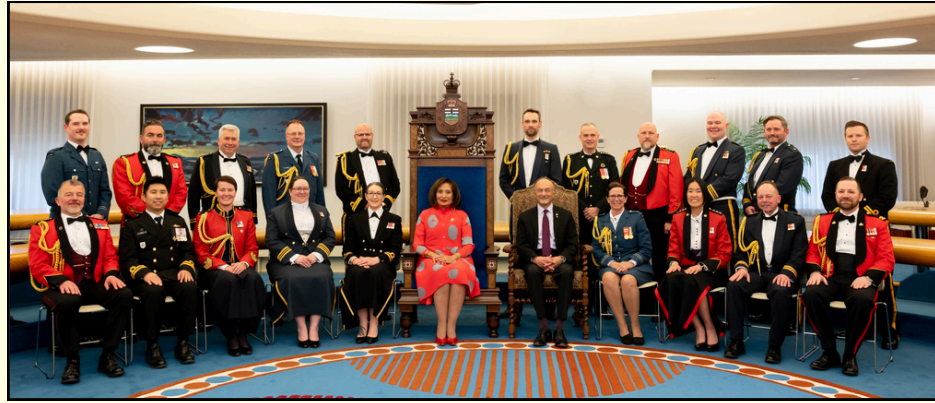
Their Honours with the dedicated group of Aides-de-Camp who volunteer their time assisting with functions.

The Honourable Salma Lakhani Lieutenant Governor of Alberta