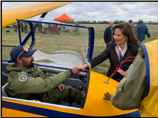
Her Honour meeting cadets in Grande Prairie at a gliding lesson

As I criss-crossed our beautiful province over past six months, the true spirit of what it means to be Albertan was reinforced for me. All of the communities I visited have one thing in common: resiliency. From Grande Prairie to Cold Lake, Jasper to Red Deer, the compassion and humanity I have witnessed continues to shine brightly. The people I met - both young and old - who shared their stories with me encapsulated the essence of being Albertan. When a community experiences a tragedy, we come together and support one another. When a community celebrates a milestone occasion or person, we proudly showcase our time and talent to make it a success. Our province has been hit hard with wildfires this year, so my heartfelt thanks go out to the brave first responders and firefighters who have been busy all over Alberta.