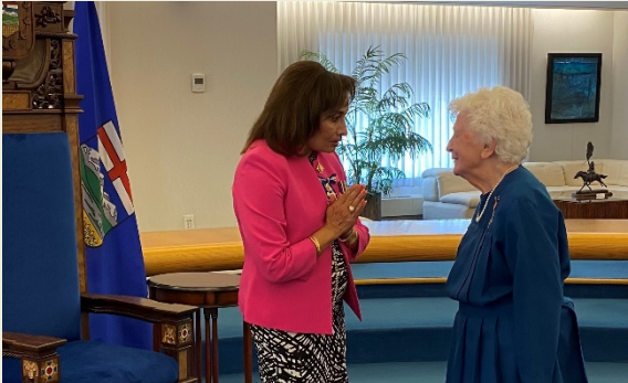
Sovereign's Medal for Volunteers presentation

Although in person ceremonies were limited this year, there were still many opportunities to celebrate our community heroes, at events such as the: Lifesaving Society Investiture, Stars of Alberta Volunteer Awards, YWCA Lethbridge Women of Distinction awards, Police and Peace Officer Memorial Day ceremony, First Poppy Presentation and Field of Crosses ceremonies for Remembrance Day, and numerous Sovereign’s Medal for Volunteer presentations over the course of the year, to name but a few.