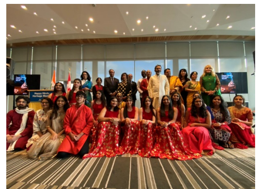
Hindu Heritage Month in Edmonton

I have been greatly inspired by all the wonderful celebrations of inclusion, multiculturalism and pluralism that I have taken part in throughout the year, from virtual gatherings to mark events such as the Lunar New Year, Black History Month,