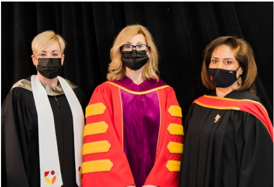
NorQuest College President Installation