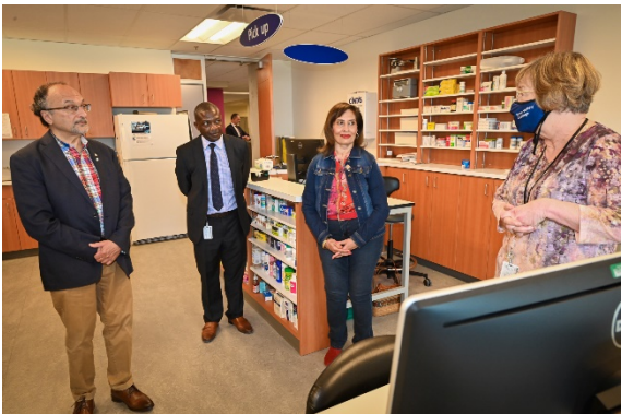
Tour of Bow Valley College in Calgary

When I meet with students, they often ask me to describe a typical day as Lieutenant Governor. The answer is that there is no such thing. I have learned that every day is different and each one brings a new insight about our province and its amazing people. While my core constitutional duties, such as granting Royal Assent to bills, signing Orders in Council and swearing in Cabinet members, are fixed and have changed little through the decades, the other elements of my job adapt to the needs and the focuses of my fellow Albertans. I will continue to listen to what people have to say and to seek opportunities to learn from people in every sector and from every corner of our beautiful province.