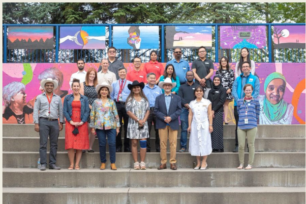
Volunteers at the Calgary Centre for Newcomers

I have always believed in the extraordinary power of grassroots volunteerism and leadership and, through the decades, I have seen the great dedication and service offered by leaders of all walks of life and political stripes.