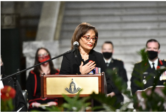
First Poppy Ceremony for 2020