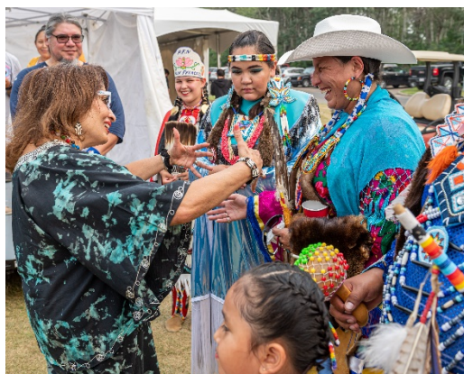
Heritage Day celebrations in Edmonton